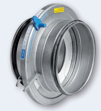
SPI, SPM Iris Damper