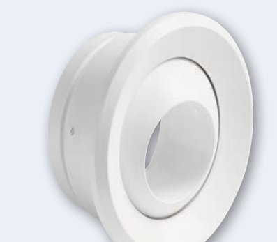
AJD Jet Diffuser