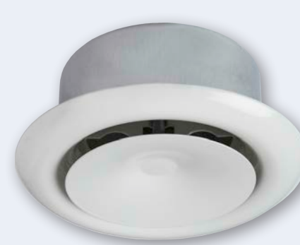
TFFC Supply Valve