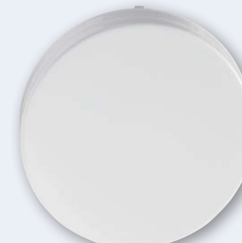
TFF Supply Valve