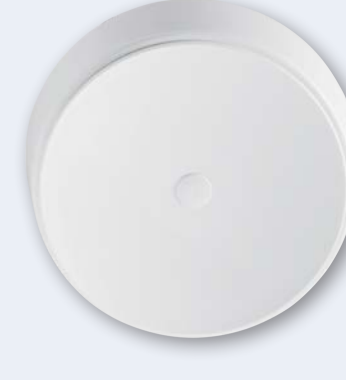
BALANCE-S Supply Valve