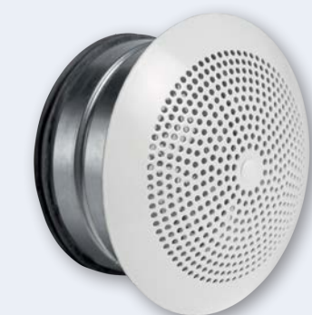
ELEGANT-VE Residential Supply Diffuser