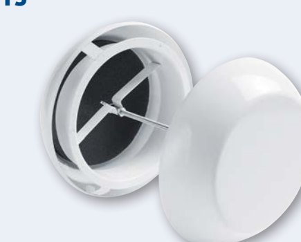
OVE Air Transfer Device