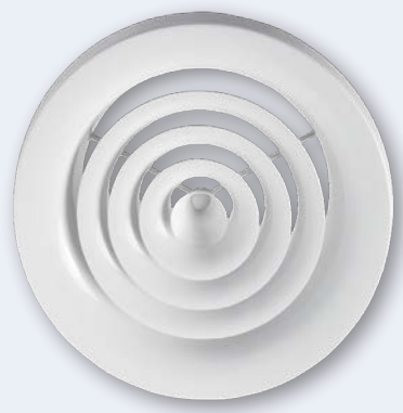
KONIKA Supply Diffuser