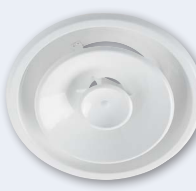
KONIKA-A Supply Diffuser