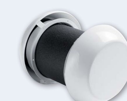
OVR Air Transfer Device