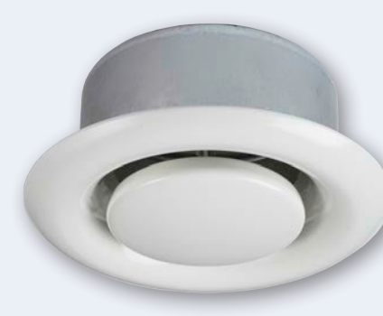
EFFC Extract Valve