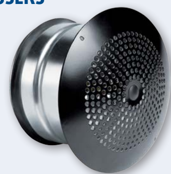
ELEGANT-AT Residential Supply Diffuser