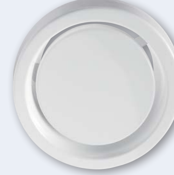
EFF Extract Valve