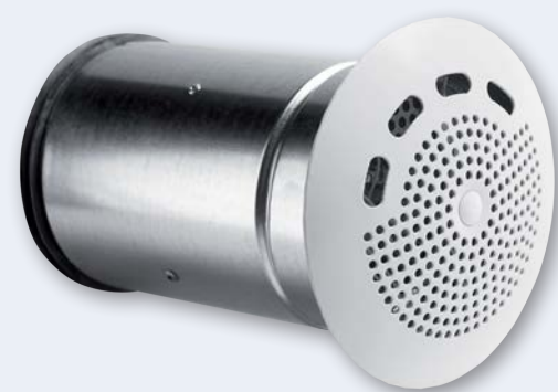
ELEGANT-VS Residential Supply Diffuser