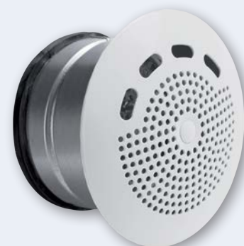
ELEGANT-VI Residential Supply Diffuser