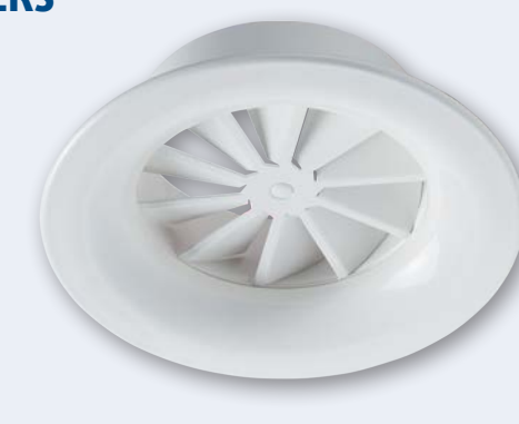
CRS Swirl Diffuser