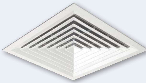
KVADRA Supply Diffuser