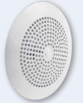
ELEGANT-VT Residential Supply Diffuser