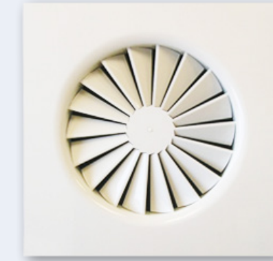
CRS-T Swirl Diffuser