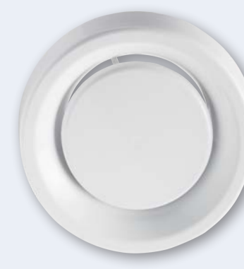
BALANCE-E Extract Valve