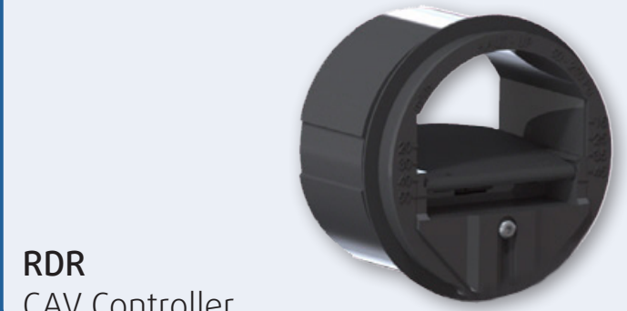
RDR CAV Controller