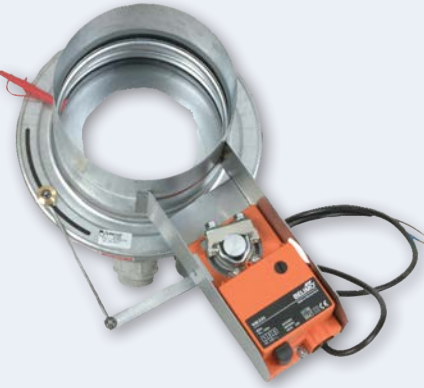
SPI-F, SPM-F Iris Damper