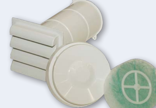
VTK Supply Valve